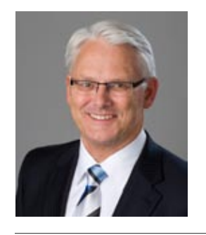
The Honourable James Moore MINISTER OF CANADIAN HERITAGE AND OFFICIAL LANGUAGES

As the Premier of the province of British Columbia, I am pleased to join in welcoming everyone to the PuSh International Performing Arts Festival.